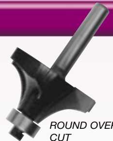
ROUND OVER CUT