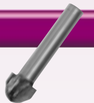
CORE BOX CUT