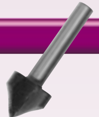
V GROOVE CUT